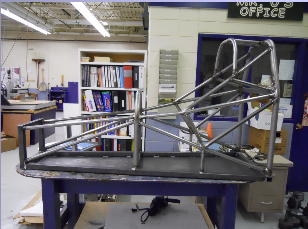
The completed chassis of our car.